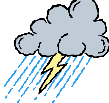
"For as the lightning that flashes out of one part under heaven shines to the other part under heaven, so also the Son of Man will be in His day" Luke 17:24.