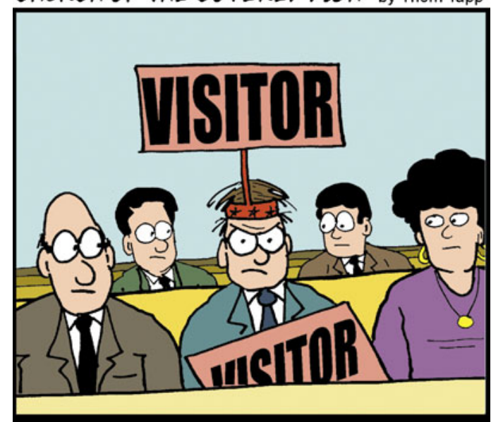
"And now, we will recognize our guests"