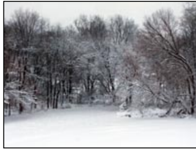
Snow scene in the neighboring town of Boyds

Big snow cancels events. A snowstorm that dumped at least 18 inches of snow on the Barnesville area was responsible for significantly altering BBC's schedule on the weekend of Feb. 11-12. The Valentine's dinner planned for that Saturday was canceled, and church services on the morning of the 12 th were limited to those few who could walk to church. The final Revelation series sermon, previously advertised for that date, will now be heard on Feb. 26.