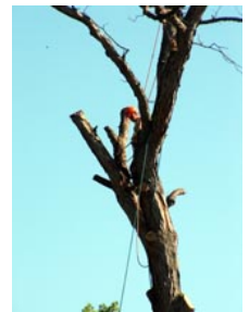
Cutting down an oak, limb by limb

More sunlight hitting the parsonage. Two more of our mighty oak trees were cut down on Jul. 7 and 14, victims of last year's dry summer and the extensive digging that was part of replacing the parsonage's septic system. For a while, it looked like the two trees might have made it, but by springtime it was clear that they had expired. The parsonage front yard certainly looks different without the oaks providing shade. New trees and grass seed will be planted in the parsonage yard this fall.