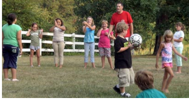
Kids play during rec time

Vacation Bible School a great success! Thank you to everyone who helped make Vacation Bible School 2007 (Game Day