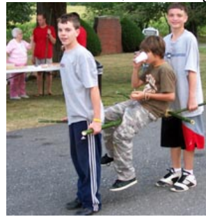
Older boys testing a bamboo chariot