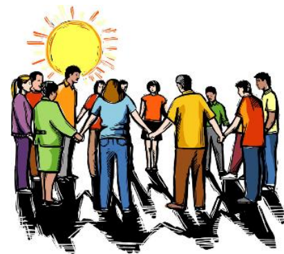
May 1 is the National Day of Prayer

"...If My people who are called by My name will humble themselves, and pray and seek My face, and turn from their wicked ways, then I will hear from heaven, and will forgive their sin and heal their land" (II Chronicles 7:14).