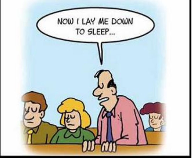
How pastors know its time for a study on prayer . . .