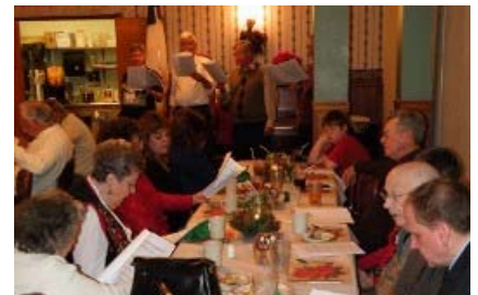
Singing carols at the Dec. 6 Christmas dinner at Mountain Gate Restaurant

Men's and Women's groups celebrate Christmas. The Baptist Men assembled 28 gift bags for the children of the Church at their December meeting and distributed them during the Dec. 27 morning worship service. The WMU's food drive received enough donations to provide several large boxes to WUMCO Help for families in the western upper Montgomery County area, as well as gifts to two families. Consider joining the men's or women's group this coming year. The WMU gathers on the second Monday morning of each month, and the Baptist Men normally meet on the third Saturday of the month for breakfast.