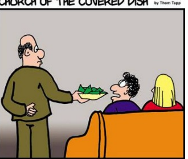
"Aren't you the pastor of the church next door?"