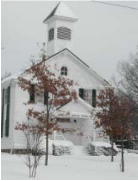
BBC snowfall on January 27

Snow policy. As we continue through the winter months, we urge all our members and visitors to exercise caution and good judgment in deciding whether or not it is safe for your family to travel on a given Sunday. Pastor Randy is only a sidewalk away from the sanctuary, and will hold services for anyone who can safely travel during inclement weather. A BBC local weather/road condition message will be posted on the answering machine. We ask that Sunday School teachers or other leaders call in their absence to the Church office at their earliest convenience.