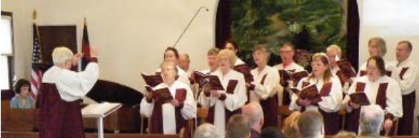
The Choir presenting The King is Coming Cantata on Easter Sunday

United States and Canada. Many of our state convention and local association leaders receive support through the NAMB, so this offering truly makes a difference in our local communities. Thank you for your prayerful generosity in support of God's Kingdom.