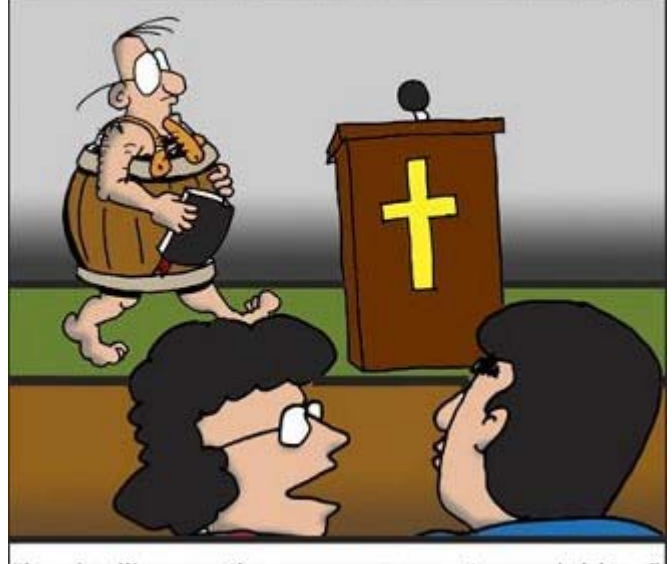
"Looks like another sermon on stewardship...'