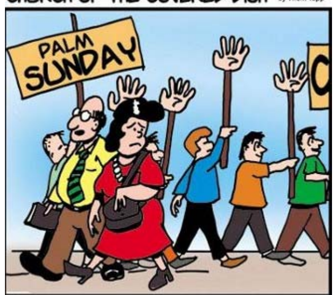
"You know Agnes... I wonder if we are getting through to the younger generation as well as we think ... "