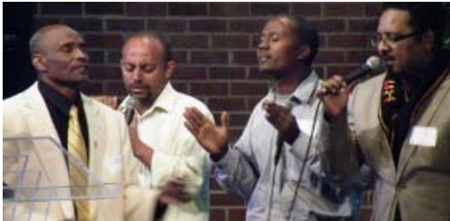
The MBA's Ethiopian language ministry performing during the meeting

MBA annual meeting report. Five BBC messengers attended the 76 th Montgomery Baptist Association annual meeting held