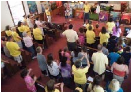
VBS Family Night on Friday evening

Vacation Bible School a good time. Psalm 147:5 and the motto of "Awesome God! Amazing Power!" were shouted in the sanctuary during the evenings of Jul. 9-13 during our aviation-themed VBS, Amazing Wonders Aviation. Thank you to everyone who helped make