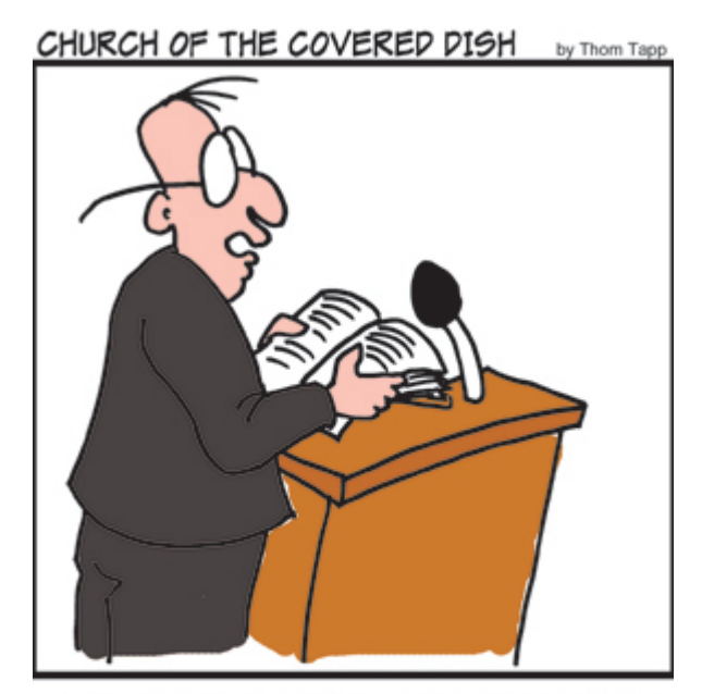
"Just to clarify... last Sunday when I preached on the 'widow's mite' I was not suggesting it as your tithe..."