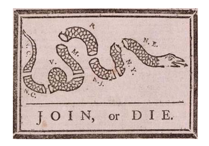
"Behold, how good and how pleasant it is for brethren to dwell together in unity" (Psalm 133:1).

July 2 Business Meeting July 4 Independence Day July 7-11 Vacation Bible School