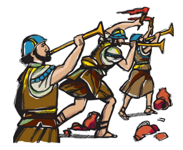
"So Gideon and the hundred men who were with him...blew the trumpets and broke the pitchers that were in their hands" (Judges 7:19).

September 1 Labor Day, Church Office Closed September 3 Business Meeting September 19 Watkins Cabinet Lunch September 20 Baptist Men's Breakfast September 26 Family Film Night