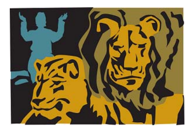
"My God sent His angel and shut the lions' mouths, so that they have not hurt me..." (Daniel 6:22).