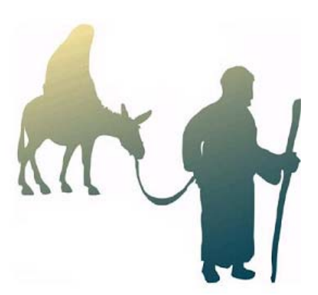
"Joseph also went up from Galilee, out of the city of Nazareth, into Judea, to the city of David, which is called Bethlehem, because he was of the house and lineage of David..." (Luke 2:4).