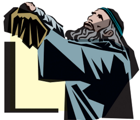
Simeon beholds Jesus in the Temple

January 1 New Year's Day January 6 Business Meeting January 15 Lunch with Watkins Cabinet January 16 Baptist Men's Meeting January 24 Baptist Men's Day & Service January 29 "War Room" Movie at Town Hall