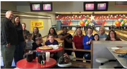
Bowling on Feb. 27 at Bowl America in Gaithersburg

April youth event. The youth will enjoy an evening of duckpin bowling from 4:00 to 6:00 pm on Saturday, Apr. 23 at the Mt. Airy Bowling Lanes located at 304 Center St. in Mt. Airy. The cost is $4.75 per person per game, shoes included. The church will provide pizza and drinks.