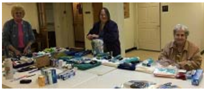
The WMU made 24 health kits at its May meeting

Summer vacation begins for several programs. Monthly