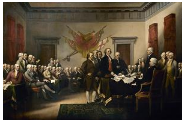
Declaration of Independence, John Trumbull, 1817

July 4 Independence Day, Church Office closed July 6 Business Meeting July 10 Frederick Keys Faith Night July 11-15 Vacation Bible School July 19 Seniors' Lunch July 23 Baptist Men's Meeting July 25 Deacons' Meeting