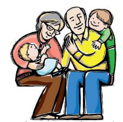
September 11 is Grandparents' Day

"Children's children are the crown of old men..." (Proverbs 17:6).