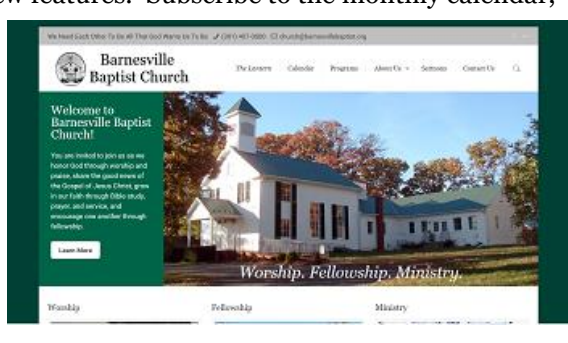
The new website is filled with color and photos

access the password-protected church directory, or send a message using our new contact us form. With the upgrade, our email address will now