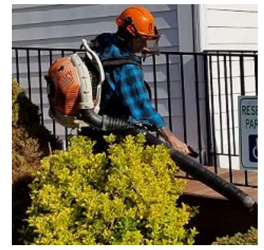
Roy Leibrand blowing leaves

windows were washed, and gutters were hung on the sheds. Rescheduled to Monday, May 7, the main parking lot on the west side of the church will be resurfaced with new gravel. The new parking lot on the east side of the church will be available if people need to visit on that day. The sanctuary will be repainted beginning Monday, May 14. Choir practice will not be