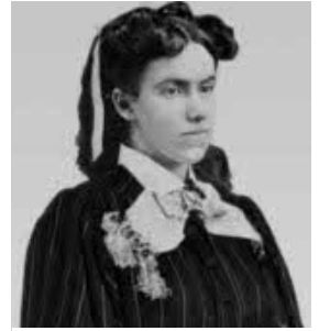
Southern Baptist missionary to China Lottie Moon

Lottie Moon Christmas Offering goal set at $2,000. Dec. 2-9 is the week of prayer for the 2018 Lottie Moon Christmas Offering for International Missions. Together, we and the IMB are able to send out more than 4,000 missionaries to share the Gospel all over the world. The national goal is $160 million; BBC's is $2,000. Last year, IMB missionaries engaged 811 people groups, planted over 12,000 churches and baptized more than 46,000 people. Please pray about a sacrificial gift for foreign missions.