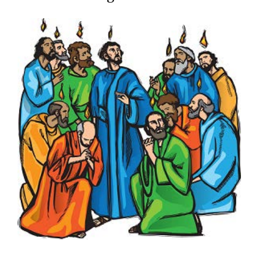
"And suddenly there came a sound from heaven, as of a rushing mighty wind, and it filled the whole house where they were sitting" (Acts 2:2).