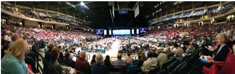
Panoramic view of the SBC meeting at the Birmingham-Jefferson Convention Complex from the BBC delegation's seats