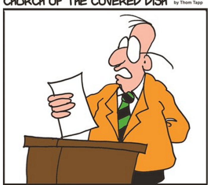
"Sorry, our finances aren't as good as I thought. I had the chart up-side-down."