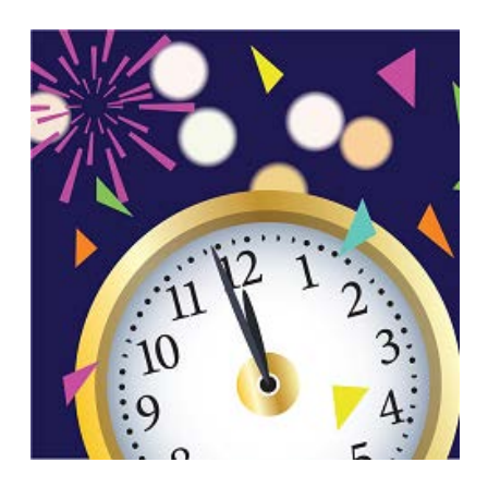
"The fear of the Lord prolongs days, but the years of the wicked will be shortened" (Proverbs 10:27).

January 19 Baptist Men's Day Breakfast & Service