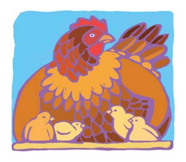
"He shall cover you with His feathers, and under His wings you shall take refuge..." (Psalm 91:4).