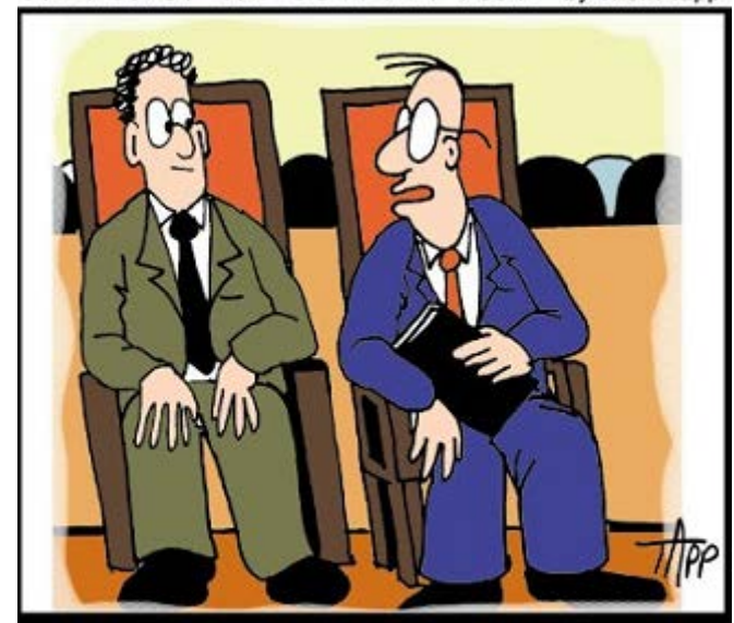
"While I'm preaching, you keep an eye on that kid with the sling-shot."