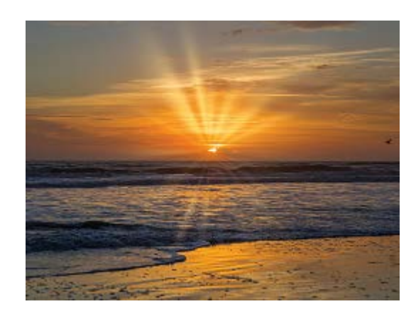
"Make us glad according to the days in which You have afflicted us, the years in which we have seen evil" (Psalm 90:15).

January 1 New Year's Day January 11 Virtual Business Meeting January 23 Deacons' Annual Prayer Session