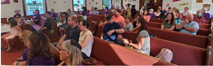
Parents and families look on as the children prepare for their class presentations on Friday night

VBS read-out. Vacation Bible School 2022 was a good time of teaching the Gospel and fellowship with new and old friends. A total of 61 kids, adults, and workers were registered for our weeklong “Spark Studios” event on Aug. 8-12. Fun was had by all as students enjoyed times of worship, Bible study, crafts, recreation, and snacks. Of note, the missions offering collected $2,000, which has been sent to our sister congregation in Pakistan, King of Glory Church, to buy school supplies for their children. Thanks to everyone who volunteered to make this year’s VBS a blessing to so many children and their families.