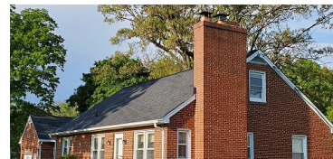
The parsonage roof was replaced on Apr. 26.