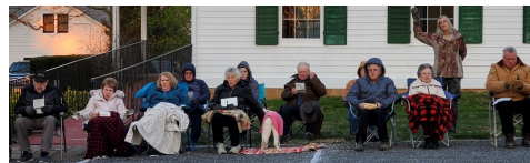
BBC celebrating Christ's resurrection at the Easter sunrise service