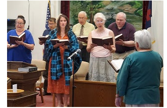
The BBC Choir has resumed practices and singing a Call to Worship on the first Sunday of the month