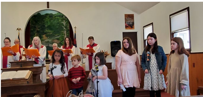
The Adult Choir and the BBC children sang "We Give Thanks to You, O Lord" on Sunday, Nov. 19 to celebrate Thanksgiving

people heard the gospel; 178,177 new believers were saved; and 21,231 new churches were started. Please pray about a sacrificial gift for foreign missions.