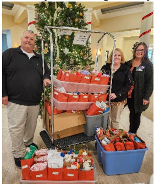
BBC donated 91 gifts to Spring Arbor seniors as well as Care Net mothers and babies for Christmas

Birthday updates requested. The Lantern enjoys sharing members' and friends' birthdays with the Church family. Please help us keep our records current by contacting the Church office with any names and dates we may lack, especially if you started attending within the last year.