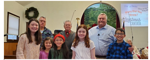
The Baptist Men gave gift bags to the BBC children for Christmas.

format to those who would prefer such an option instead of a copy sent by mail. If you would like to receive a monthly email with a link to the Lantern , please send an email to our masthead address. Those who wish to continue receiving a paper copy of the Lantern will continue to receive one; no further action is required.