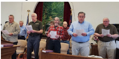
On Mar. 10, the MOB Choir sang "Down to the River" and "Fishers of Men".